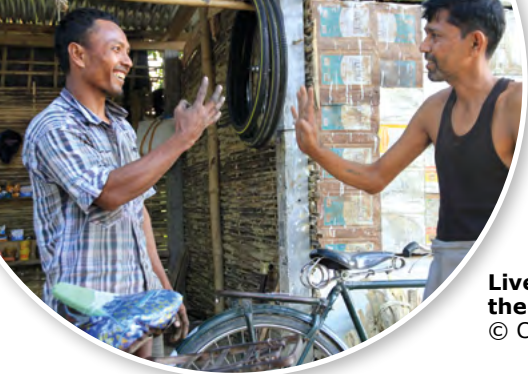
Livelihood in the community