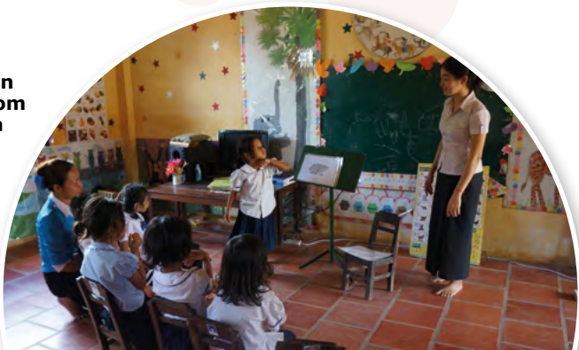
Deaf children in a classroom in Cambodia

CBM collaborates with partners on local, national, regional and global levels, by providing technical and financial support as well as engaging in Alliance Building and Advocacy. Partners on the Global level include IDA (International Disability Alliance), IDDC (International Disability and Development Consortium), WHO (World Health Organisation), UN (United Nations) bodies, and professional associations.