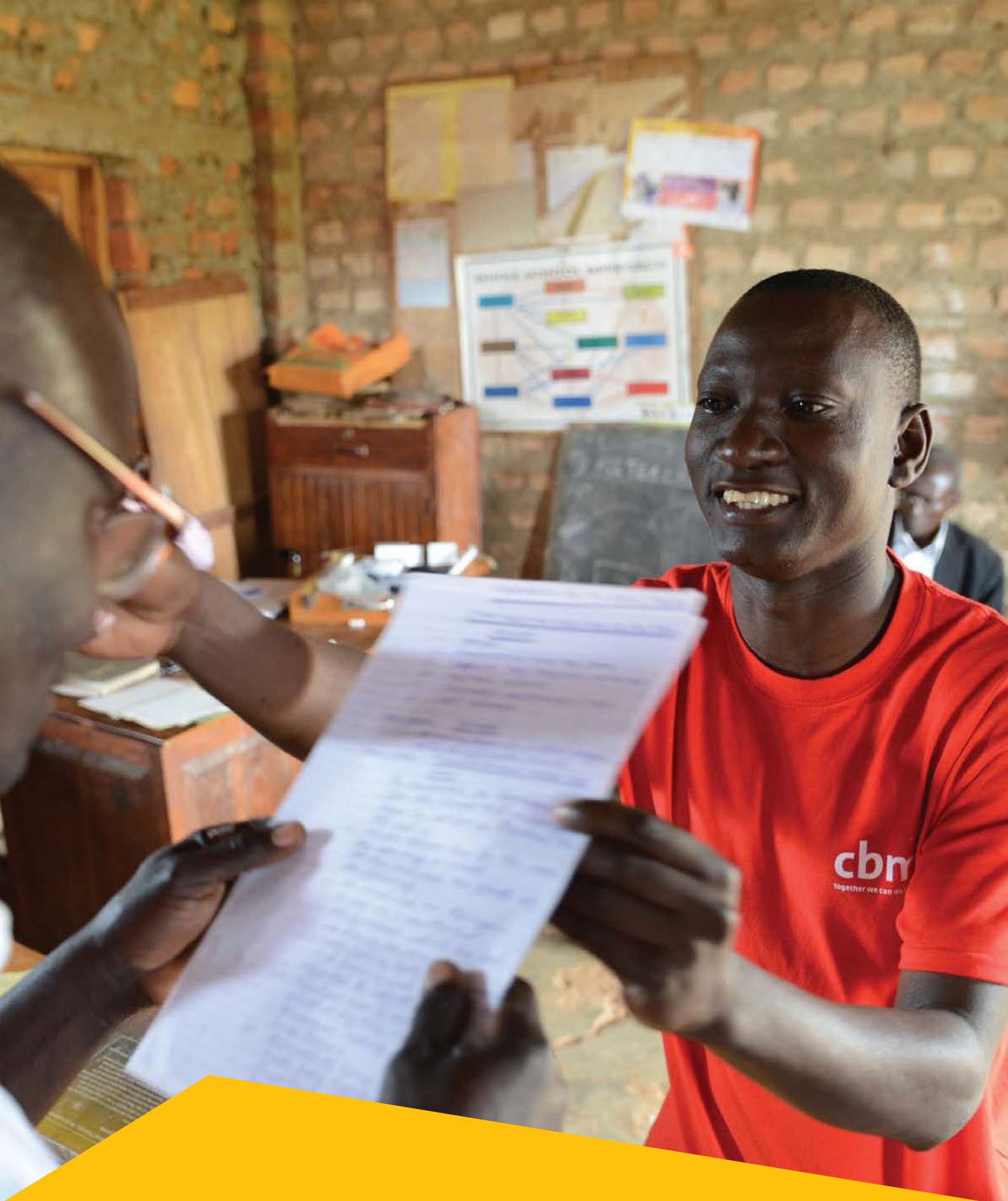
Man in a CBM teeshirt hands over a piece of paper to another man.